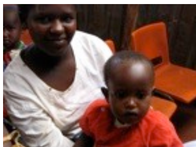
Anajali Advocate May 2011

Anajali Ministries is a non-profit 501(c)3 charitable organization. All donations are fully tax deductible and are used in their entirety to help the children of the Anajali School. Donations given to Anajali Ministries are non-refundable.